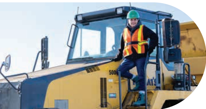
Heavy Equipment Training Program

Esquao is the stylized version of the Cree word for woman.