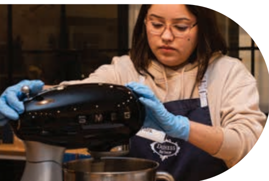
Duchess Bake Shop partnership workshop