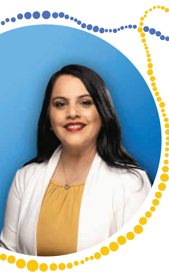
The Honourable Rajan Sawhney, Minister of Indigenous Relations