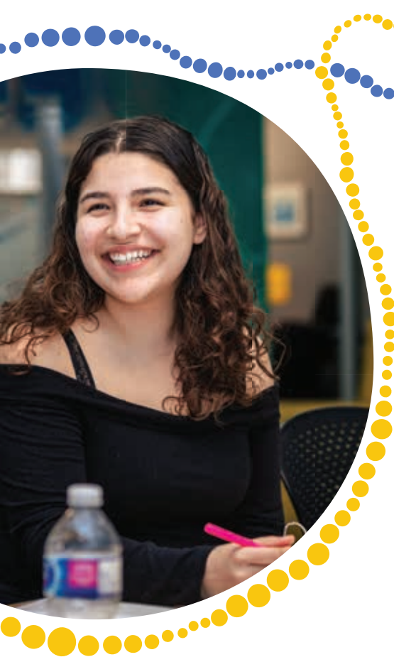
Driver Training Program